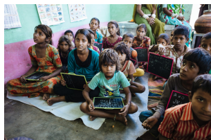
Sponsor Kids Education