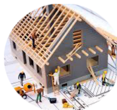
Donate for JJA Infrastructure Development