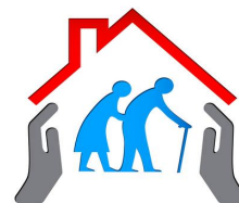
Sponsor Adults Activity