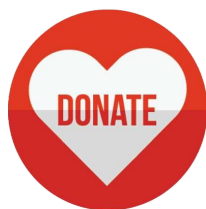
General Donate to Ashram