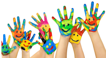
Sponsor Kids Activity